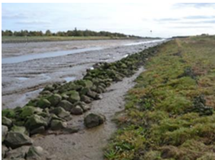
Plate A17-2 Rocks in Front of Saltmarsh